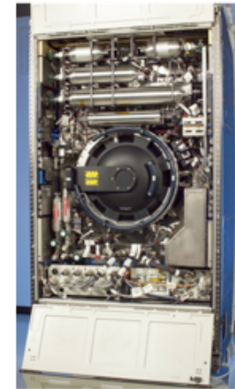
CIR Flight Unit